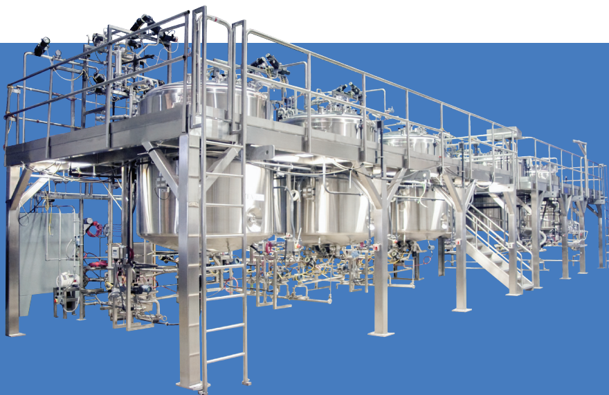
INTEGRATED PROCESS SYSTEMS