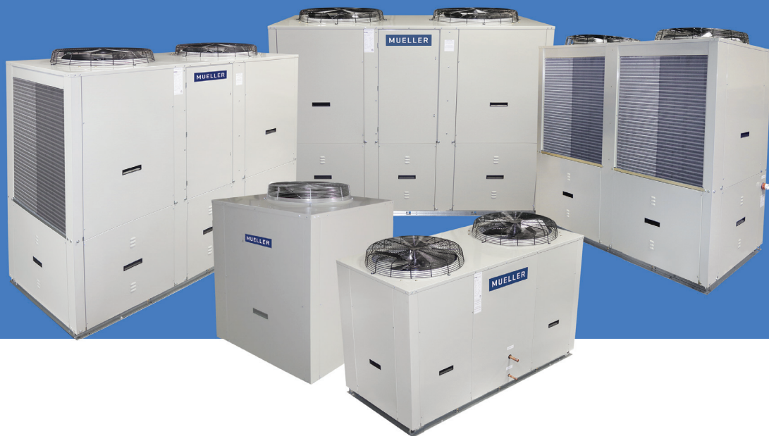
PACKAGED & SPLIT-SYSTEM PROCESS CHILLERS